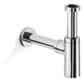
Linea 53922 Our best seller