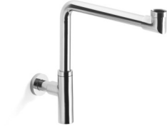
Linea 53921 Space saving